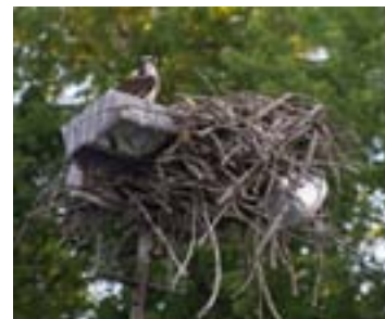
Above. Nest atop the Global Oil dock flood light pole. Below. Nest atop a 40 foot stump deep in the marsh.

Jim Woodworth recently attended a training session and will monitor the two nests in the meadows every two weeks from the arrival of the osprey in a few weeks until the chicks are fledged and grown..