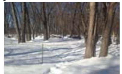
Note the yellow trail marker at the south end of the Goodwin C. trail at the Putnam Bridge.