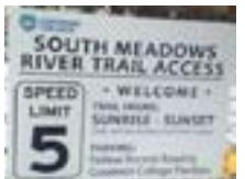
Welcoming sign at the gate on South Meadow Road off High St, East Hartford.

Hockanum Meadows, and across two of our parcels there. This section is now open to the public and allows access to