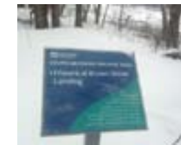
Informational sign along .2 mile handicapped accessible trail.

Goodwin College is in the process of building a walking trail through