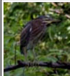
A green heron perches on a log in the pond.

#4 Look and listen for red wing blackbirds perching on cattails, red tail hawks soaring, and great blue heron hunting in the brook.