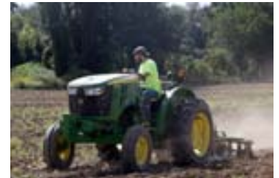
Jared Anderson harrowing.

#5 In the farm field observe the sweet corn crop or the cover crop, or the farmer at work. Imagine